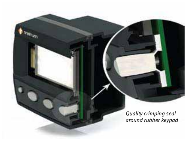
R300 IP65 sealing arrangement of buttons